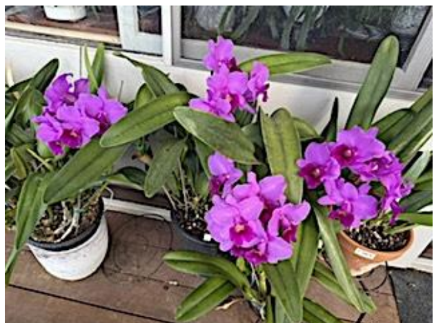
Lc. Little Suzie 'Joy'