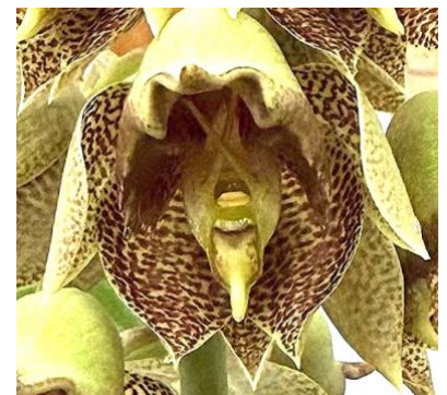
Ctsm. sanguinea 'Xlnt Shape' x Ctsm Albo-Virens 'SVO'