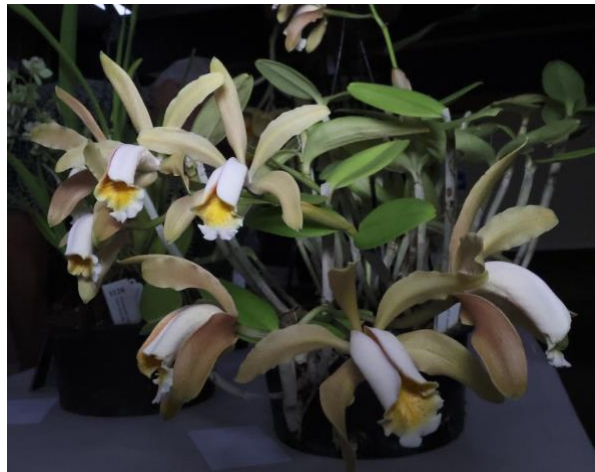
C. forbesii f. aurea