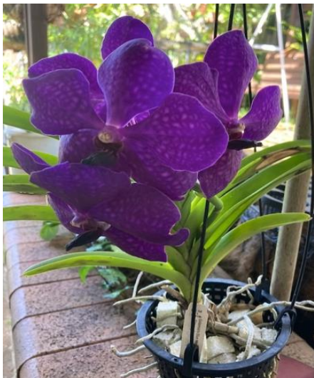
V. Golamco's Blue Magic 'Dreamy'