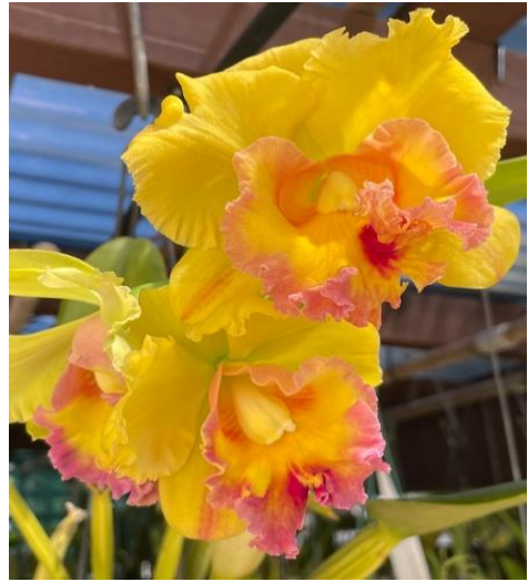
Blc. Beverly Blietz 'Bette' x Blc. Goldenzelle 'Tokyo'