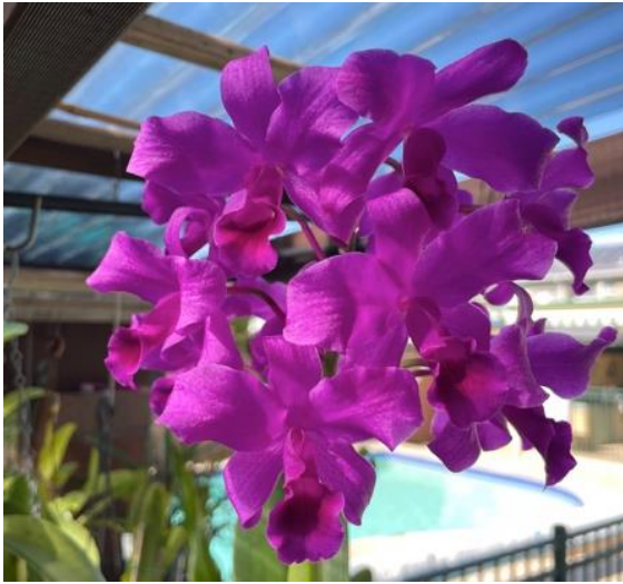
C. bowringiana Harwood Var.