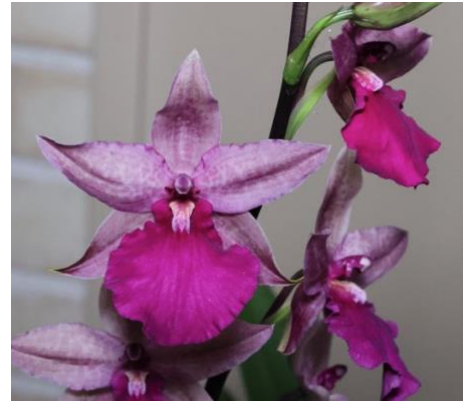
Odtna. Pacific Paranoia 'Other Side of Kool'