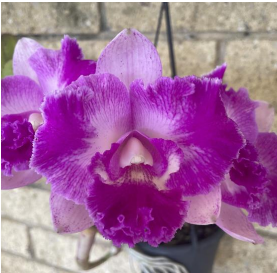
Bc. Island Charm x C. Monte Elegance 'Pink Malo'