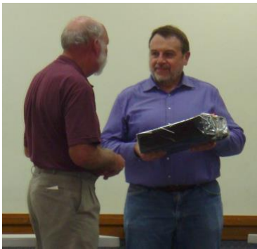
Awarded Life Membership 2015