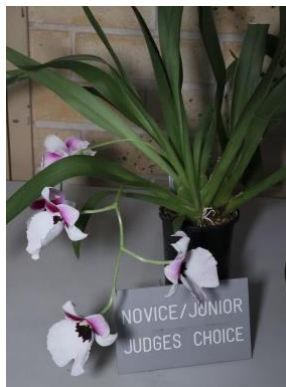
Milt. Rubenesque 'Brockton'