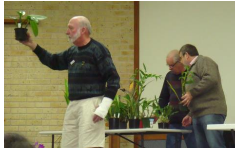
Assisting on 'Auction Nights'