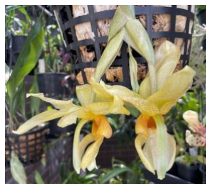
Stan. wardii var. aurea