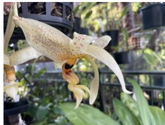
Stan. oculata sub. ornatissima