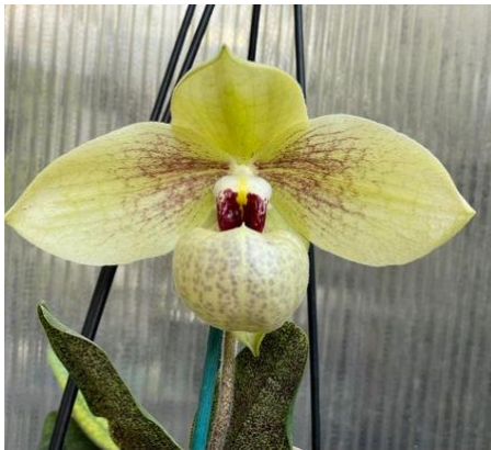
Paph. Mem. Larry Heuer