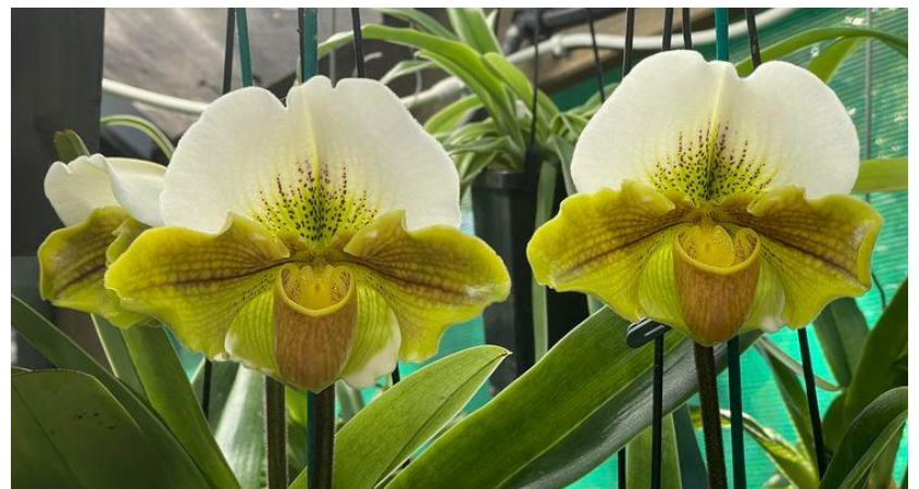
Paph. Julia Marsh 'Fairfield'