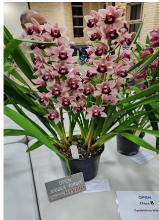
Cym. Rod's Tango 'Tobruk'