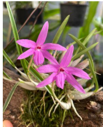
Soph. (Isabelia) violacea