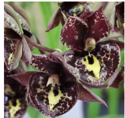
Ctism. Louise Clarke 'MC'