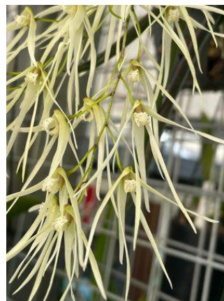
Doc. (Dend) grimesii