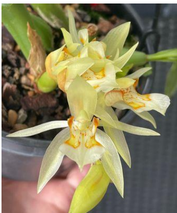
Coel. assimica 'Kingston'