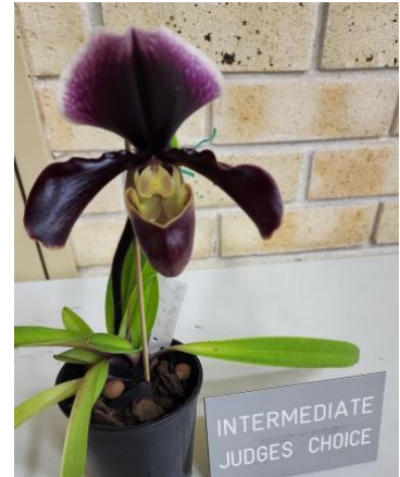
Paph. Mac Worth x Enzan Crow