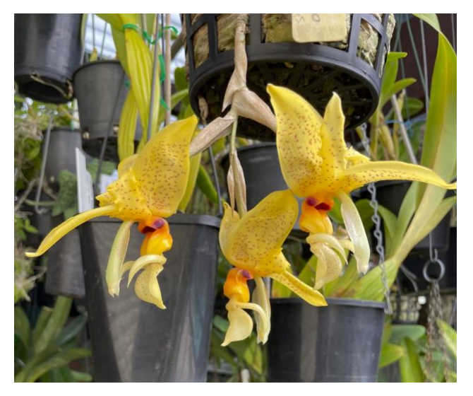
Stan. oculata subs. ornatissima