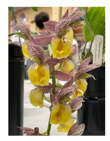
Ctsm. Portagee Star 'Brian Lawsons Sunrise' x Ctsm. Dentigrianum 'SVO' Excellence