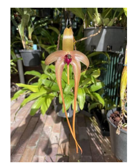
Bulb. echinolabium (with pollinating bee caught in the act!)

Link to Neutrog's March Newsletter: Neutrog March 2024 Newsletter