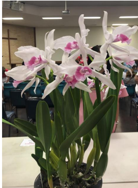
Catt. purpurata 'Lorraine'