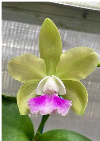
Blc. Topaz Sublime 'Tall Icy' x Slc. Elizabeth Calov