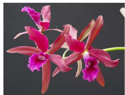
Laelia Zip (C. tenebrosa x C. milleri)