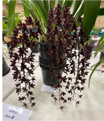
Cym. Blackstump 'Come in Spinner'