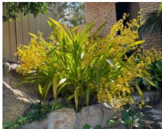
A huge specimen of Onc. 'unknown'