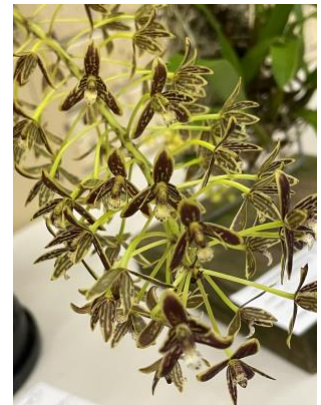
Cym. canaliculatum v. purpurascens 'Willow'