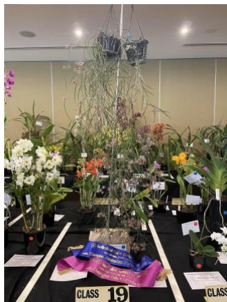
Champion Misc. Den. Beaumont 'Longlast'