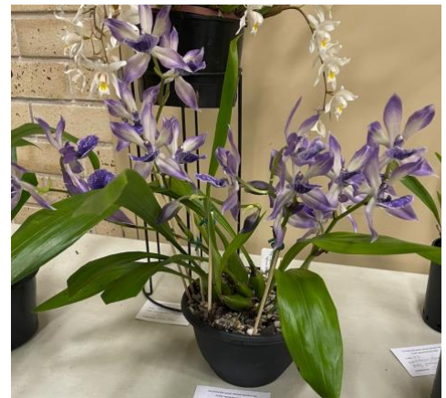
Zygonisia Cynosure 'Bluebirds'