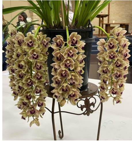
Cym. Mary Green 'Showgirl'