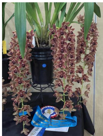
Champion Cymbidium Cym. Dr Len 'Ruby Sunset'