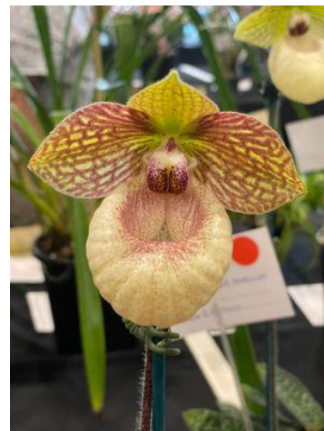
Champion Paphiopedilum Paph. Fanaticum 'No1'.