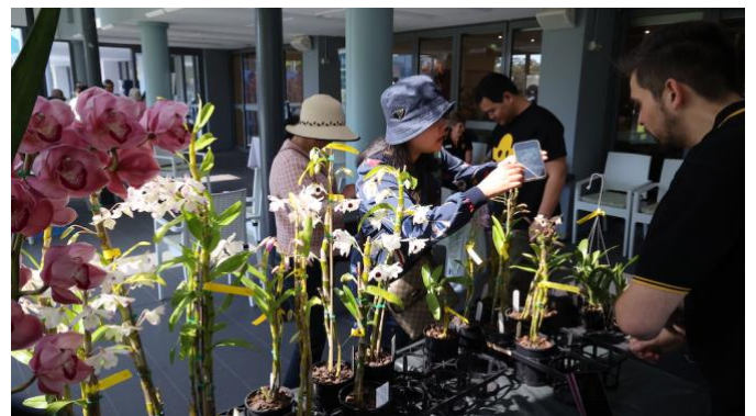
The sales table was kept busy!