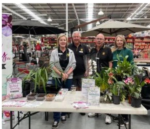
'Spring Launch Day' stand at Caringbah