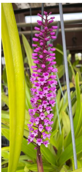
Arpophyllum giganteum 'Huge'