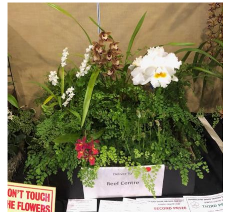
3 rd - W & J Chapman