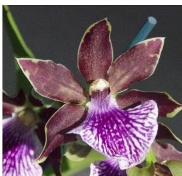
Z. Arthur Elle x Titanic 'Allwing'