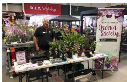
'Spring Launch Day' stand at Kirrawee