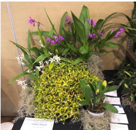
1 st - G. Birss