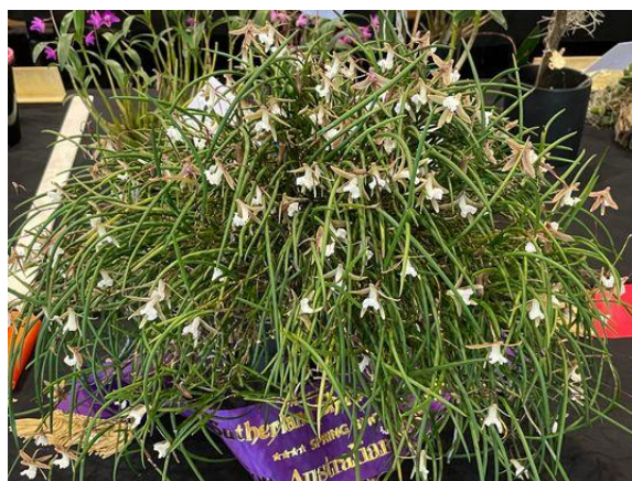
Champion Aust. Native Species Den. striolatum 'Ruffles'