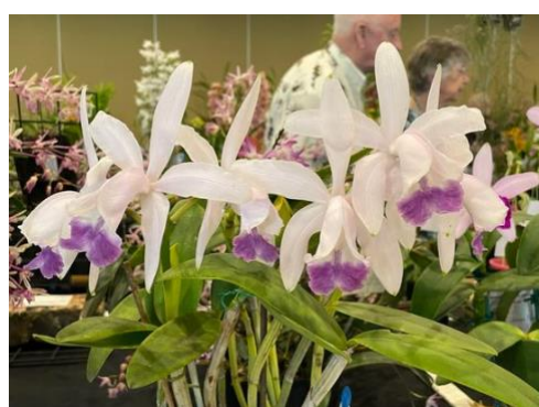
Champion Species and Champion Orchid exhibited by an Intermediate, Novice or Junior C. intermedia var. coerulea