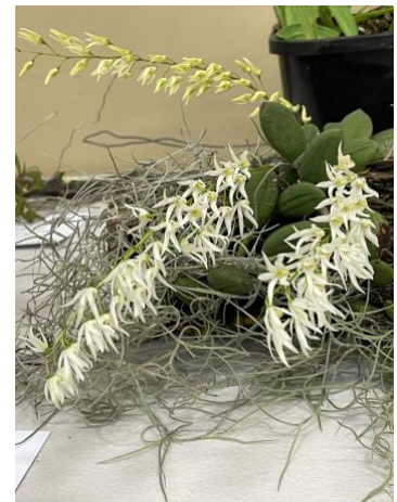
Den. linguiforme var. nugentii