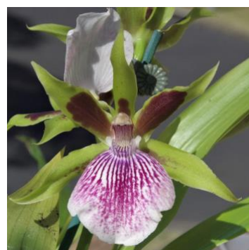
Gal. Arlene Armour 'Conching'