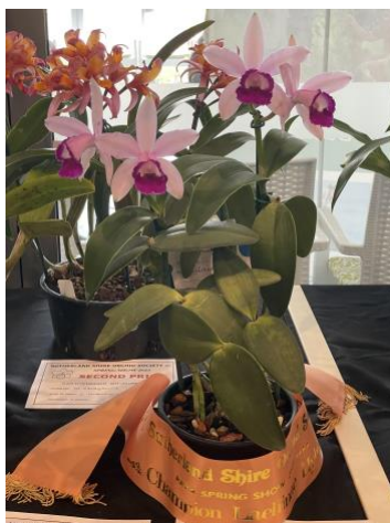
Champion Laeliinae C. Crown Fox