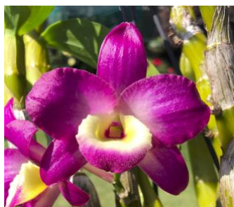
Den. Comet King 'Akatsuk'