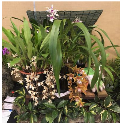
2 nd - D. Hicks