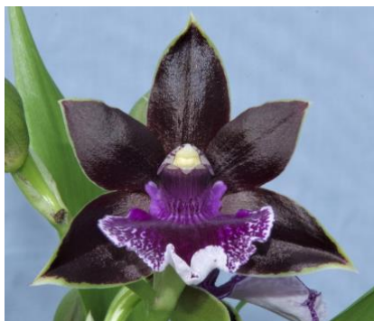
Z. Debbie De Mellow 'Honolulu Bay'