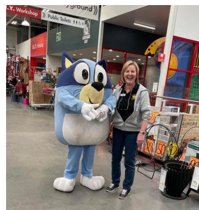
We even had a visit from Bluey!