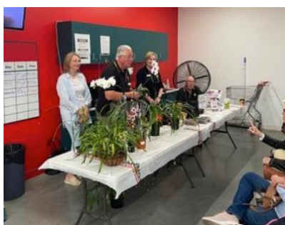
Re-potting at Bunnings Caringbah.

These sessions are great initiatives and partnerships for the Society to undertake, and we extend our appreciation to the Bunnings Activities Organisers at both stores for their generous sponsorship towards our show prize money in 2023.