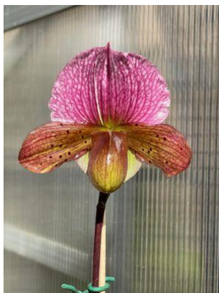
Paph. charlesworthii 'Coral' x Macabre Leap Hsinying