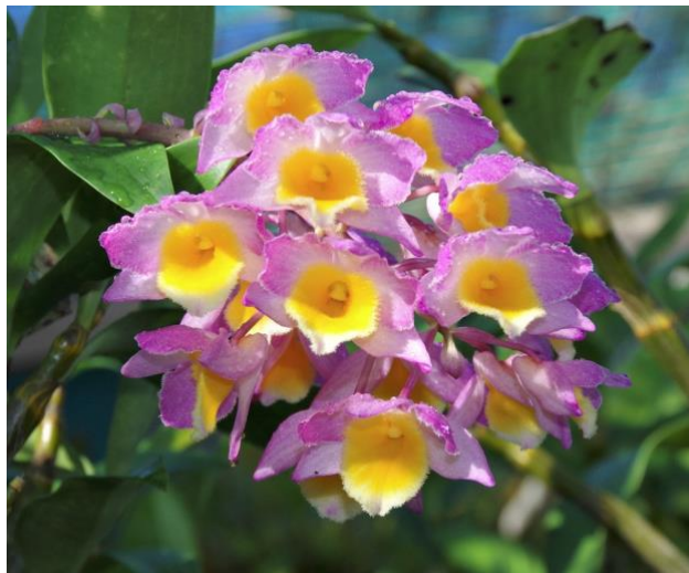
Dend. pink farmerii x Dend. amabile