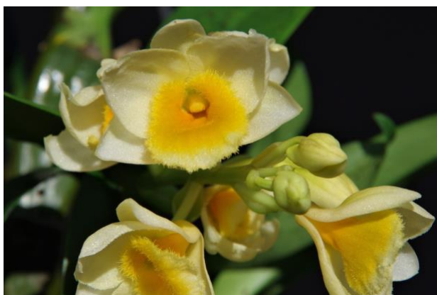
Dend. yellow farmerii