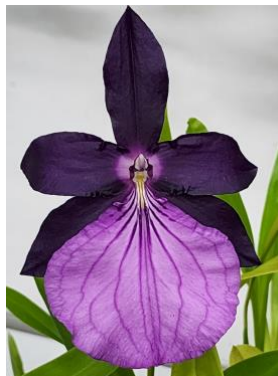
Milt. moreliana 'Big Ben'