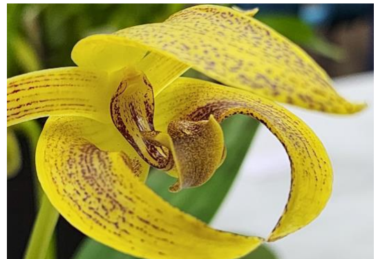
Bulb. Wilmar 'Galaxy Star'