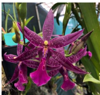
Beallara Sadie Loo x Milt. Christmas Eve