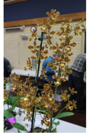
Gomesa praetexta 'Mathew' AM/AOC