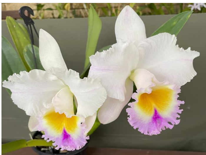
Blc. California Girl 'Orchid Library' AM/AOC