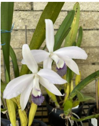
L. perrini var. coerulea