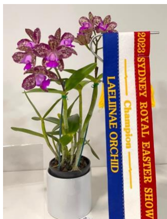
C. Caudebec Candy 'Burgundy MC'