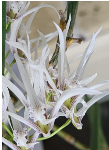
Dend. Goose Bumps '1977'.