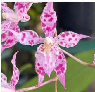
Oda. Heatonensis 'Plush'