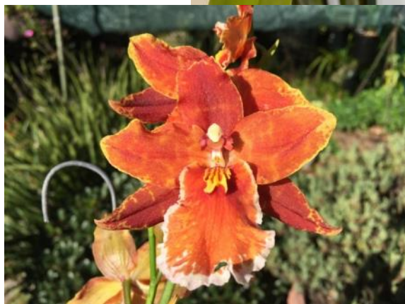
Wilsonara Inferno