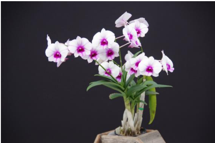
Dendrobium Mary Poppins "Orchid World"