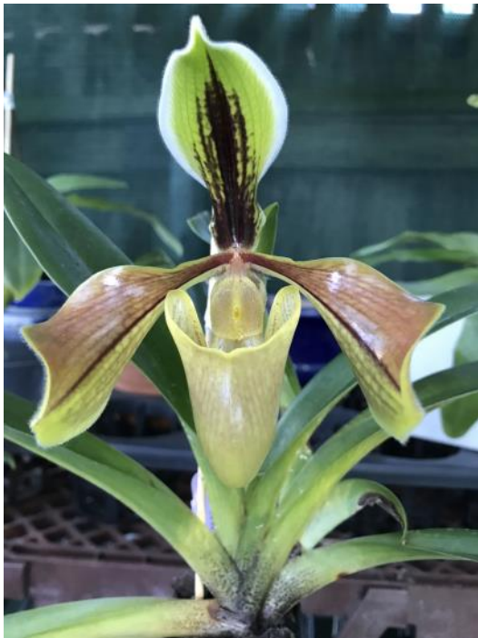
Paph villosum 'Nev's' (Jan Robinson)