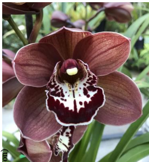
Cym. Khan Flame 'Tuscany' (Jan Robinson)