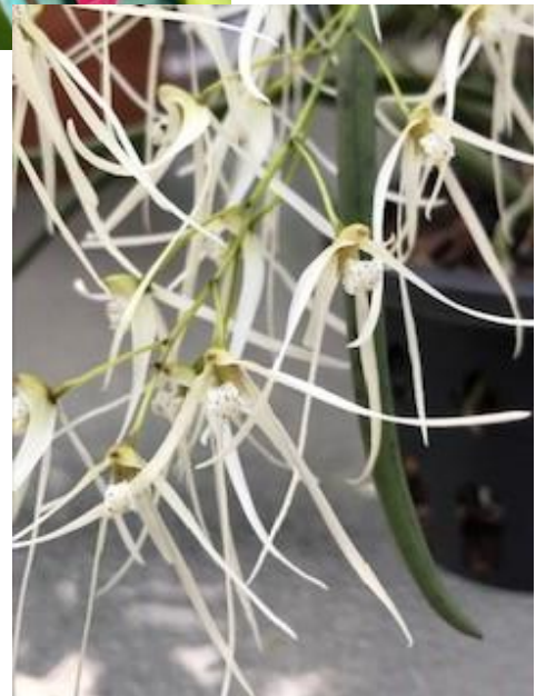
Den. grimesii