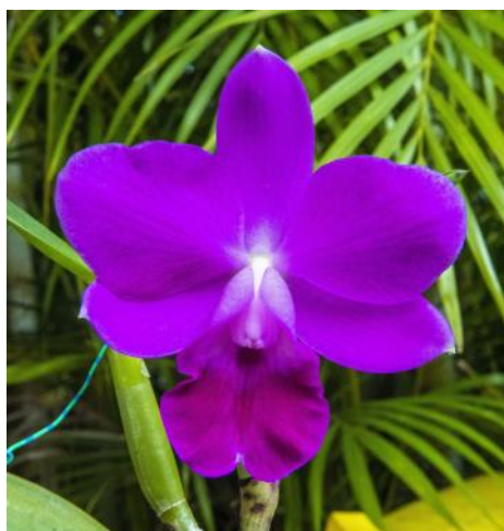
#52 C. Unknown (Ian Ware)