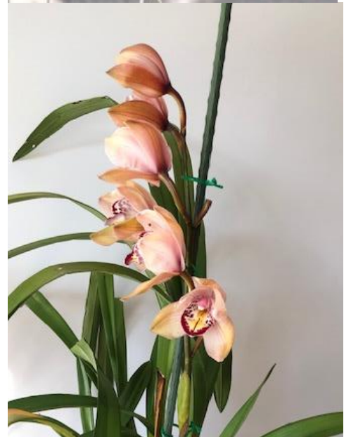
Cymb. Unknown (Gifford Bunt)